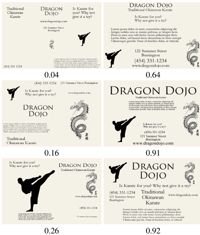
Figure 4. Worst and best rated layouts from each interface. Top: baseline without suggestions. Middle: suggestive interface. Bottom: adaptive interface. We report the mean fraction of votes from AB testing.

the adaptive and baseline interface (called the “Direct” interface in the study). Users performed a short tutorial, then created two layouts with that interface. The user then switched to the other interface, completed that tutorial, and created two other layouts. The order of interfaces was random. After using both interfaces, workers provided a 5-point Likert scale rating for each, a binary preference (either baseline or adaptive), and optional comments. 40 workers completed the test.