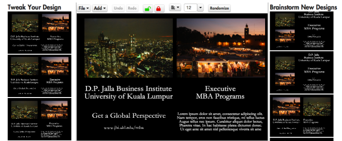
Figure 1. DesignScape Interface. The central canvas allows the user to create layouts in a simple editor. On the left, the system provides refinement suggestions , layouts similar to the canvas, but slightly improved. On the right, the system provides brainstorming suggestions large-scale layout changes in a variety of styles.

This paper presents a novel system for graphic design using layout suggestions, i.e., changes in the size, position, and alignment of elements. Our system proposes two complementary types of suggestions: refinements which improve the current layout, and brainstorming suggestions which explore alternative layouts with large changes in style (see Fig. 1). Exploration and refinement are critical and complementary